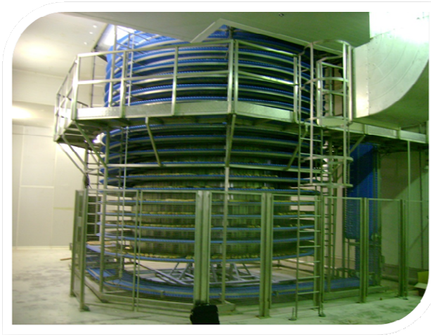
Triphase Spiral Freezer Refurbishment for a major bakery in the south of England.

Date: Thursday 12 th September 2013 Start time: 7.30 p.m. Location: Keighley (see address details overleaf)